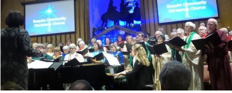
Christmas program 2019

Community Christmas Concert at Sequim Adventist Church Dec 1, 7:00pm; Dec 2, 2:00pm; Dec 3, 2:00pm