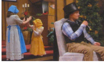
Christmas program 2022

Peninsula Adventist Elementary School Christmas Program at the church Wednesday, Dec 13, 6:30pm