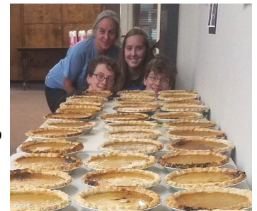
From previous years.